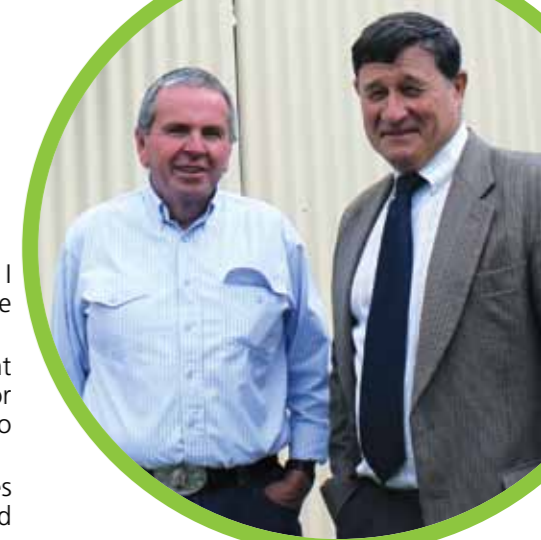
Top: Congratulations to the Oberon community on the opening of the local Men's Shed.

Happy second birthday to the Parkes Men's Shed and congratulations to all those involved in getting the project up and running for the community of Parkes.